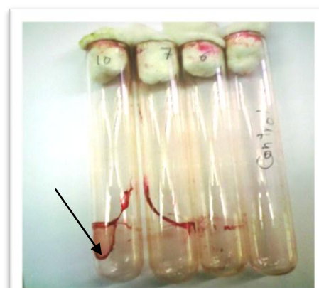
Figure (2): Christensen method showing that P 10 isolate have a great ability for adhesion (→).

Adherence properties vary from strain to strain and the attachment matrix used. The first step in the pathogenesis of pseudomonal infections is the bacterial attachment and colonization [19]. However, four main groups of adhesins have been identified which