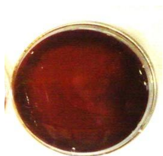
Figure (1): P. aeruginosa P (10) isolate in Congo red method, showing the black colonies with a dry crystalline consistency.

The results show that P 10 isolates have the greater ability for adhesion in both Congo red agar methods Figure (1) and in Christensen method Figure (2). Both methods described here are based on the enhancement of exopolysaccharide production by using enriched media, Tryptic Soy Broth (TSB) in the Christensen method [10], while the Congo red agar method also requires the use of a highly nutritious medium Brain Heart Infusion broth with 5% sucrose supplementation. Congo red stain was chosen because it has been used as a stain for showing the presence of the exopolysaccharide of aquatic gram negative bacilli [9].