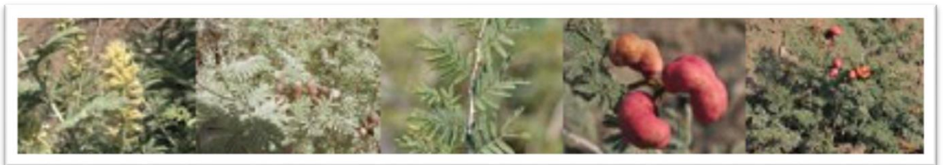
Figure: (2) Prosopis farcta